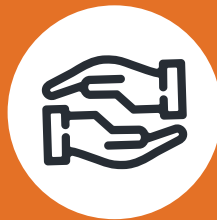
Support, advice and guidance for MATs to maximise benefits of PiXL in schools