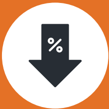
Discount arrangements for MATs with full-sector engagement