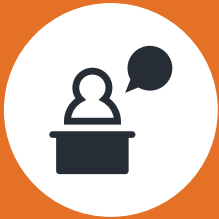
Three in-person national conferences