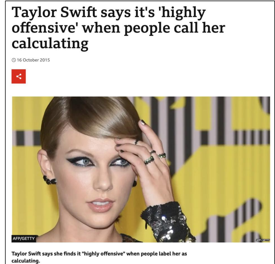
BBC October in 2015