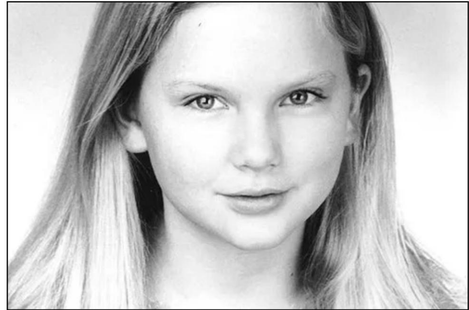
Taylor Swift Childhood: 10 Years Old: Headshot