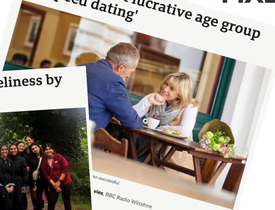
so successful vies, BBC Radio Wiltshire